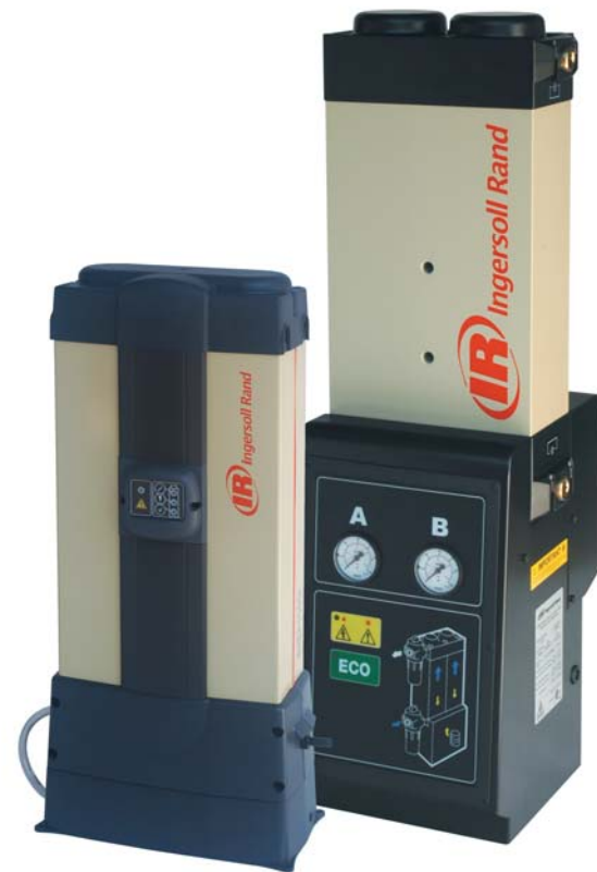
D51M to D341M Modular Dryers

Our dryers feature standard ISO Class 2 dewpoint performance, with optional ISO Class 1 to meet the most stringent requirements. This helps prevent corrosion and minimizes production disruptions or losses due to moisture or contamination. And easy on-site maintenance – less than 15 minutes after 12,000-hours of use – gets you back on line quickly.